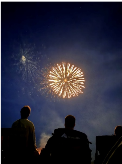
Figure 1 - Second Place - Amy Harvey